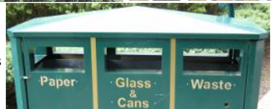
18. October - March