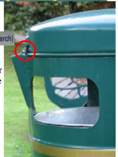
19. A Litter Bin Hinge

We hope you have enjoyed this treasure hunt. If so, tell your friends and try our other treasure hunts.