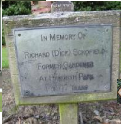
11. A Gardener